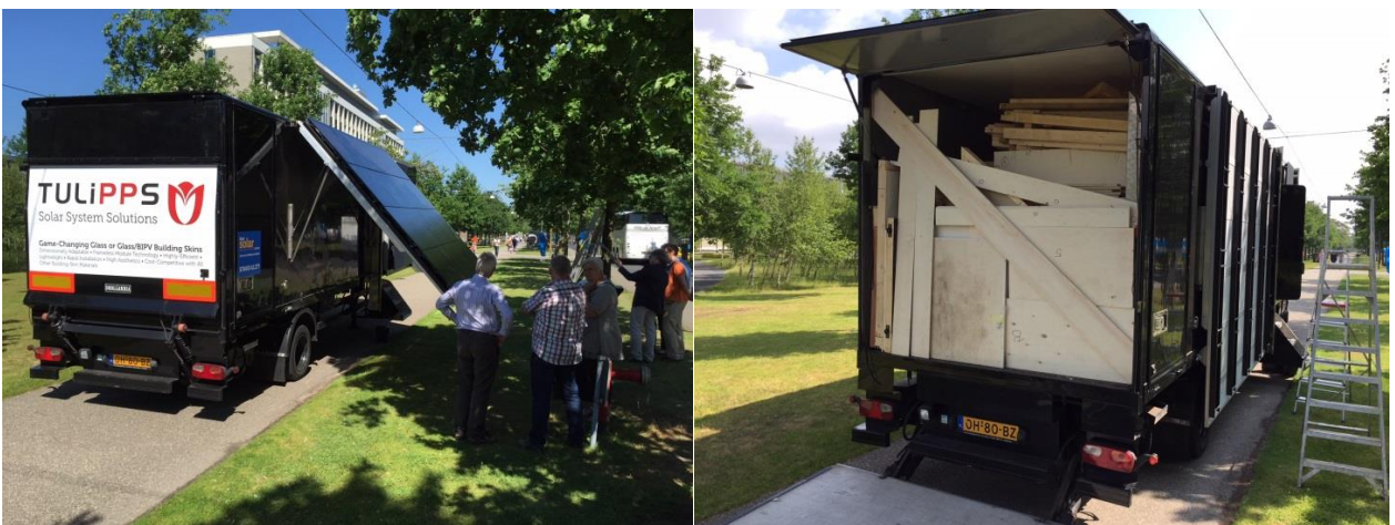
Picture 3 and 4: the demo- / dissemination truck at the Dutch Design Week (2015). In the rear loading bay of the demonstration truck fits the SUMMIT exhibition booth or 8 units of 120 cells modules.