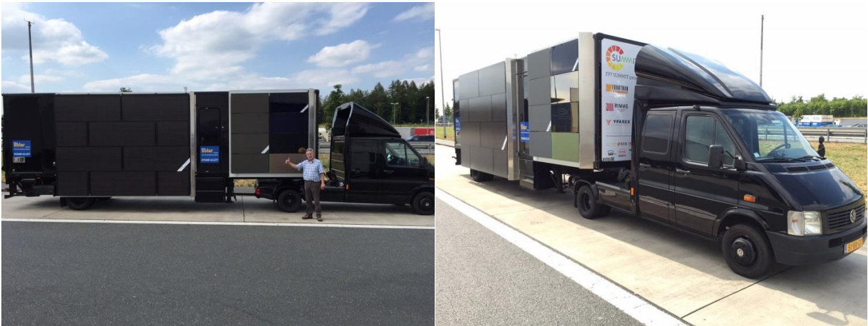
Picture 1 and 2: the demo- / dissemination truck on its way to Intersolar 2015