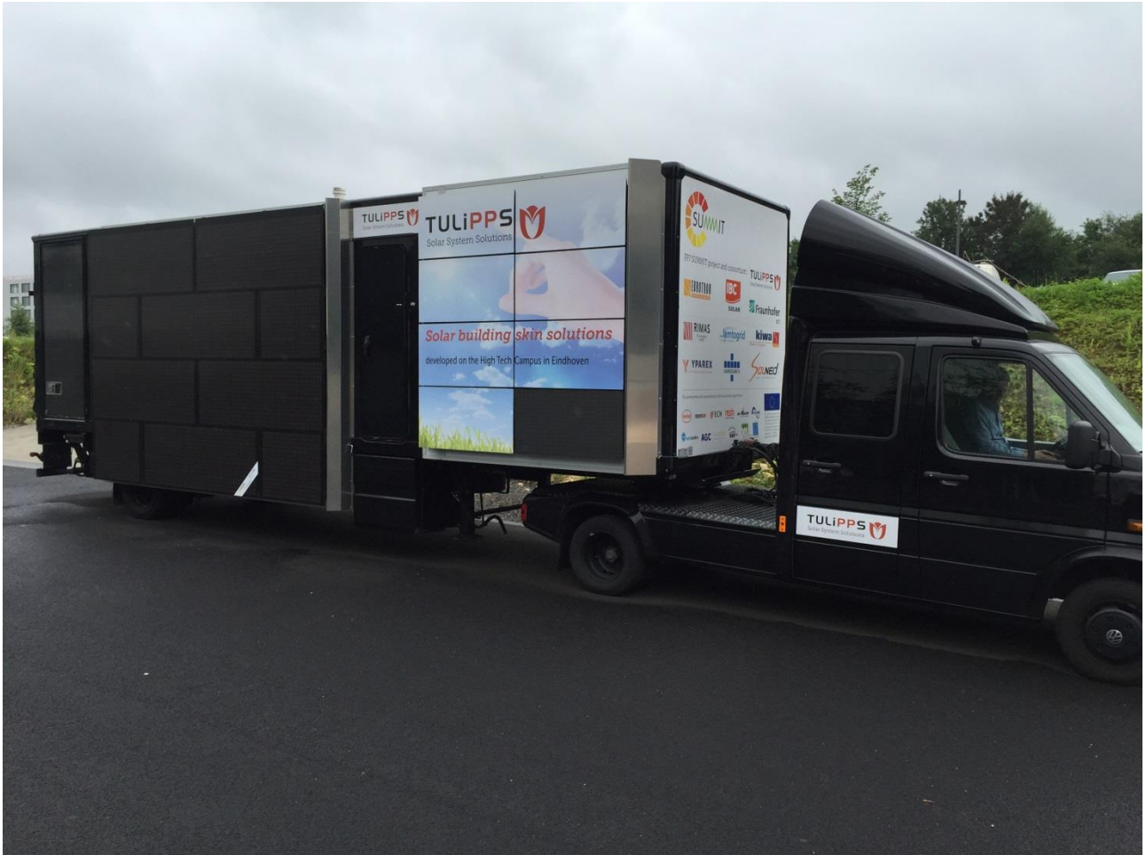
Picture 5: The demo- / dissemination at LG Innovation Fair in Aachen, Germany (2015)